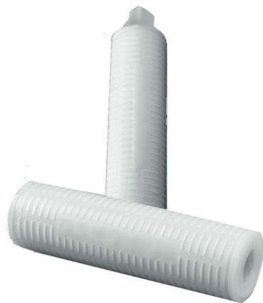
Figure 1: Memtrex PC Filters