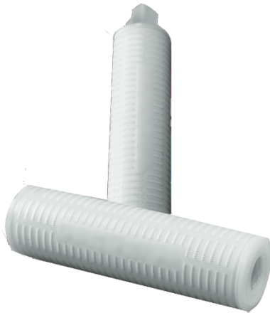
Figure 1: Memtrex HFE filter

Memtrex* HFE are made entirely from fluoropolymer materials including Halar (ECTFE). Halar is a trademark of Ausimont.), and PTFE. Halar is an industrial-grade fluoropolymer with excellent solvent resistance. MHFE benefits of the edge lamination technology assuring a lower pressure drop and increasing flow rate. MHFE filters can withstand the harshest process conditions due to its construction using these highly resistant materials. Providing broad chemical compatibility, you can count on our filters to produce consistent, uniform process streams in your most demanding filtration applications. MHFE deliver high flow rates and high purity results with absolute rated efficiencies (99.9% filtration efficiency at rated pore size based on ASTM F795 and F661 test methods) and retention characteristics that outperform other filters.